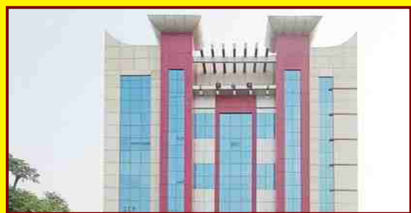
HOTEL IVORY RETREAT, LUDHIANA