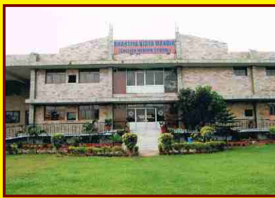
BHARTIYA VIDYA MANDIR SCHOOL