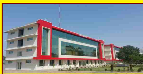
MOUNT CARMEL SCHOOL, ZIRKPUR