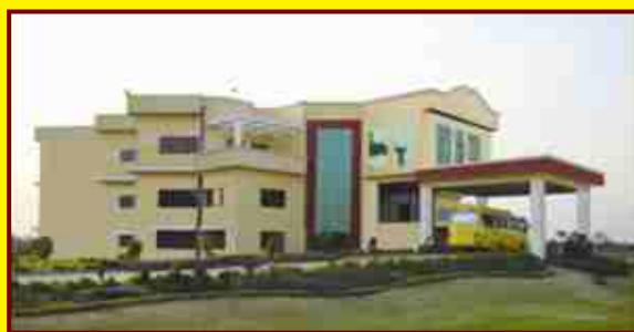
SBS MANAGEMENT COLLAGE