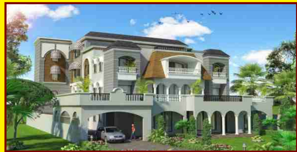
RAJ SOAP (GURDEV NAGAR)