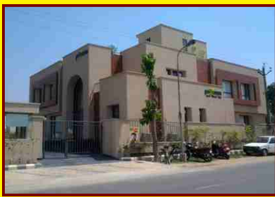
PALWAN GROUP SCHOOL

To maintain excellent interpersonal relationship with our clients and always strive hard to maintain their dreams and aspirations into reality.